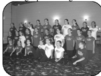
Members of Anita's Dance Center of Muskego

The banquet was also very entertaining with the dancers from the Anita's Dance Center of Muskego performing for us. They were great!